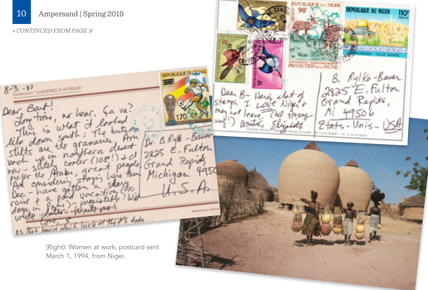
(Right): Women at work; postcard sent March 1, 1994, from Niger.

in shaping their lives were much more complex and harder to impact. Writing again from Chad, this time in 1989, she complains about the unrealistic questions she is expected to ask: