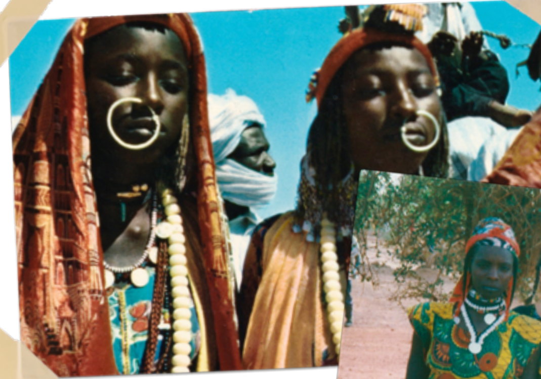
Goran dancers; postcard sent Sept. 2, 1987, from Chad.

Chad has a hold on me now: my French is good and I can understand most of the Arabic I hear though my speaking is limited. I have a great time holding fractured conversations; the Chadians I work with crack up and say they have to be careful what they say about the honkies now, and the peasants laugh in delight. . . I really enjoy it and regret that I don't have the time to study it formally. . . Plus there's so many things here that fascinate me, that I'll regret the day I leave.